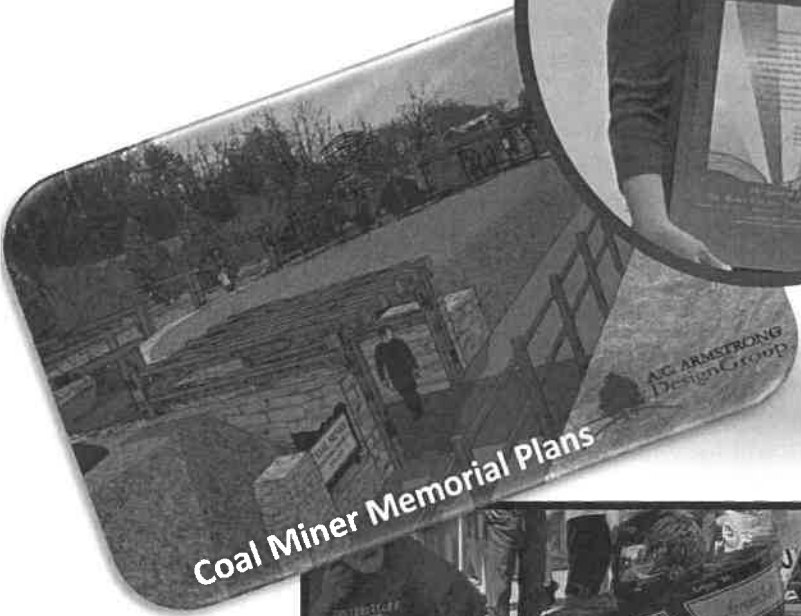
Coal Miner Memorial Plans