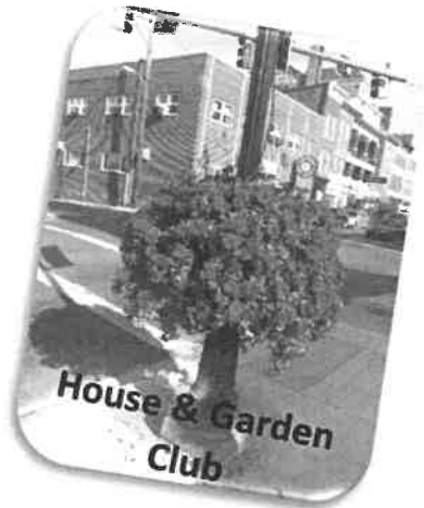
House & Garden Club