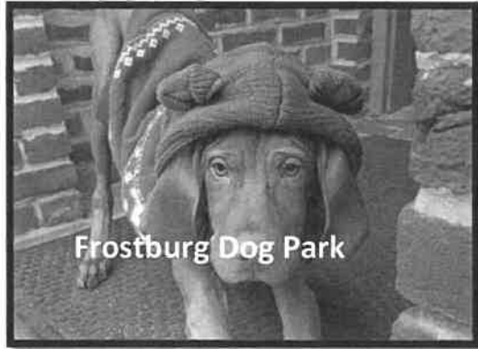
Frostburg Dog Park