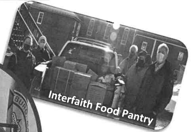
Interfaith Food Pantry