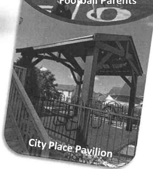
City Place Pavilion