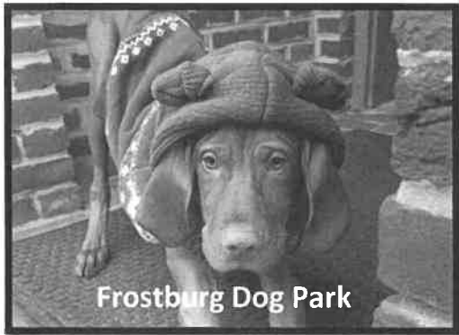
Frostburg Dog Park