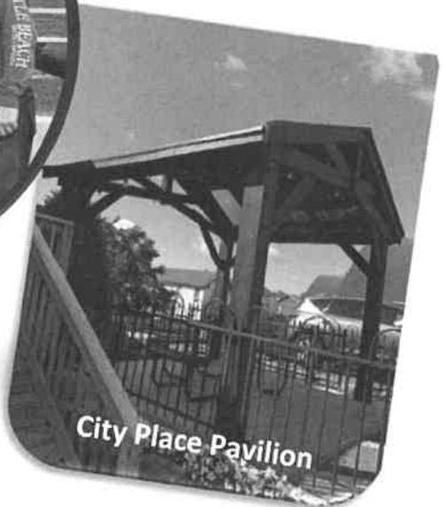
City Place Pavilion