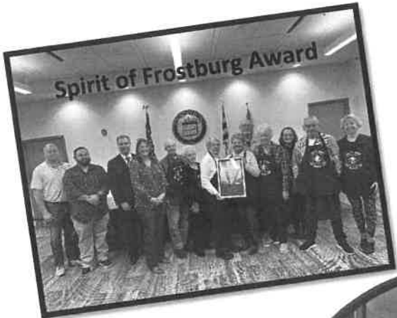
Spirit of Frostburg Award