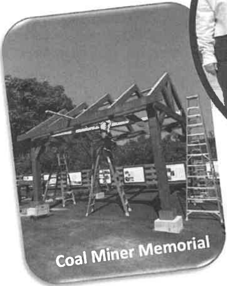
Coal Miner Memorial