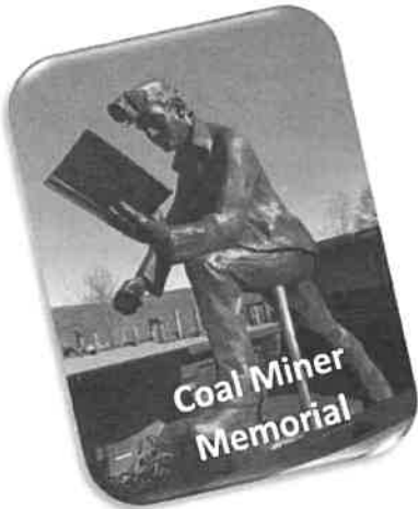
Coal Miner Memorial