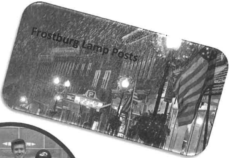
Frostburg Lamp Posts